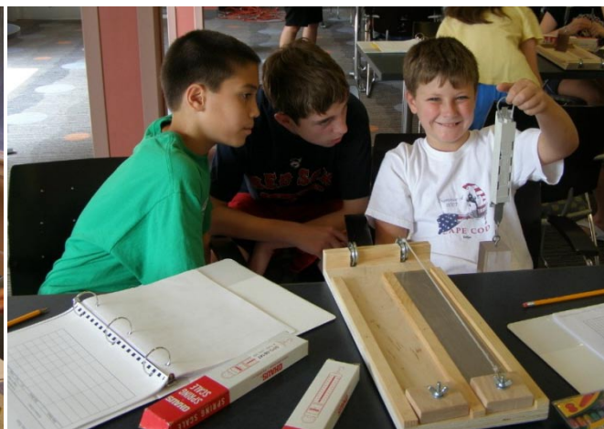
Math and Science Summer Enrichment Program participants study force and friction during the "Mysterious Machines" unit.